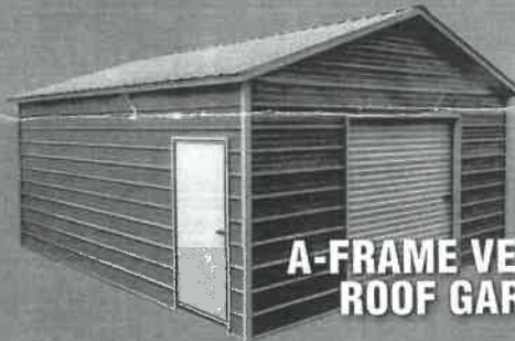
A-FRAME VERTICAL ROOF GARAGE

Price Includes Delivery and Installation