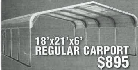
18'x21'x6' REGULAR CARPORT $895