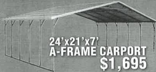
24'x21'x7' A-FRAME CARPORT $1,695