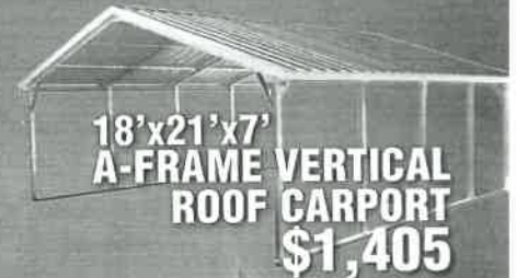
18'x21'x7' A-FRAME VERTICAL ROOF CARPORT $1,405

Price Includes Delivery and Installation